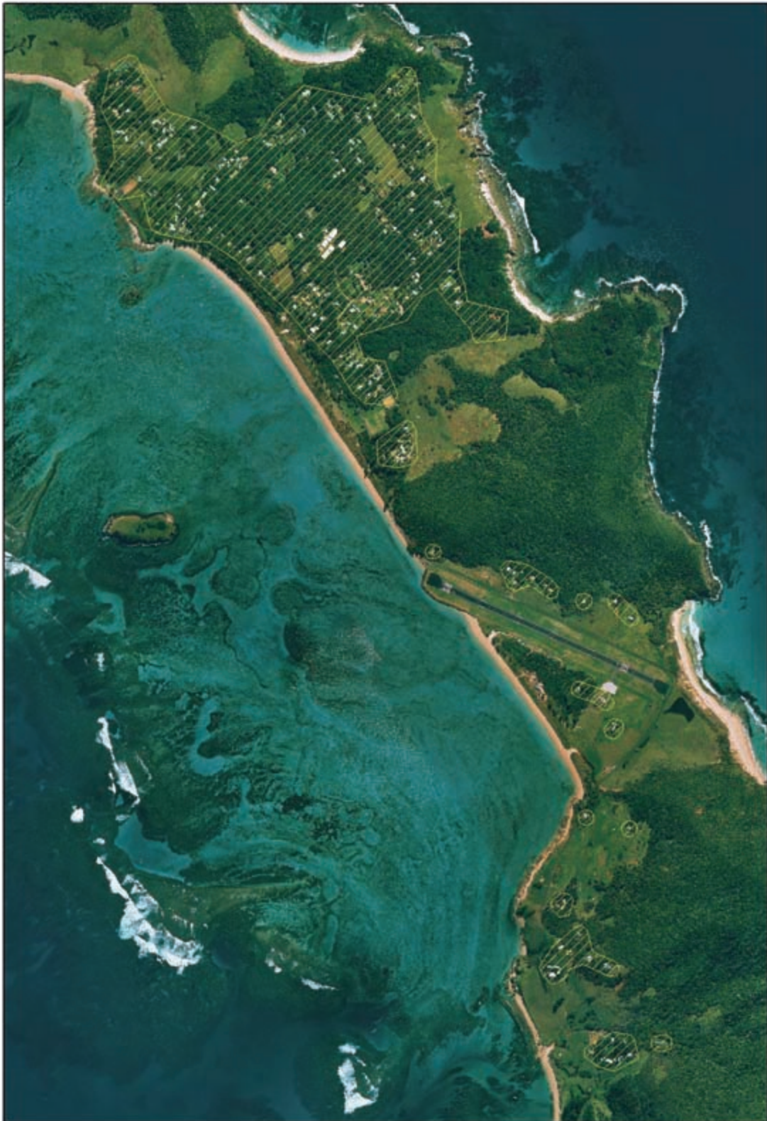
Figure 2. Areas proposed to be hand-baited (shaded areas)